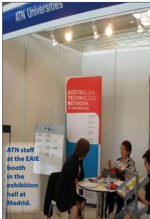
ATN staff at the EAIE booth in the exhibition hall at Madrid.

The European Association for International Education (EAIE) is a non-profit organisation whose main aim is to stimulate and facilitate the internationalisation of higher education in Europe and around the world, and to meet